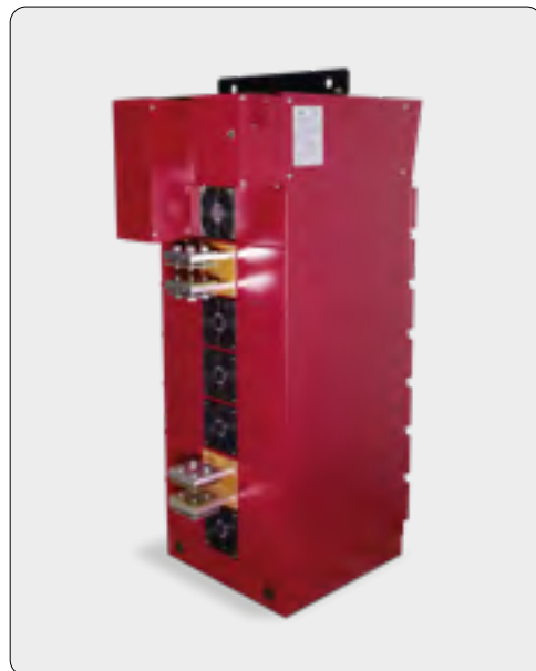
BACK VIEW - AIR COOLED VERSION