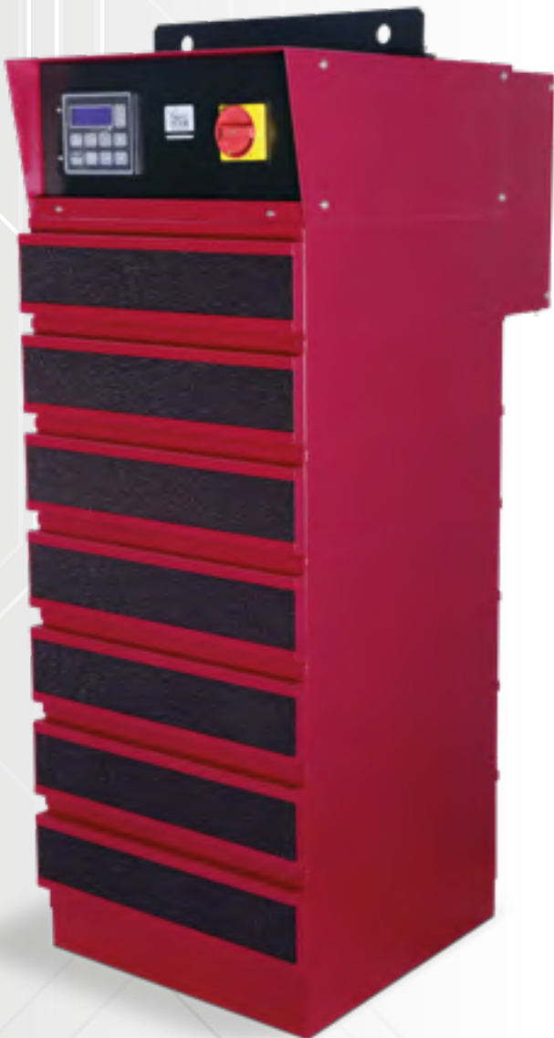
AIR COOLED VERSION