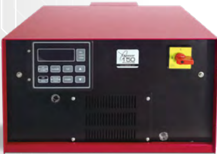
AIR COOLED VERSION