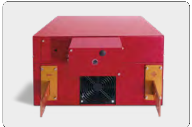
BACK VIEW - AIR COOLED VERSION