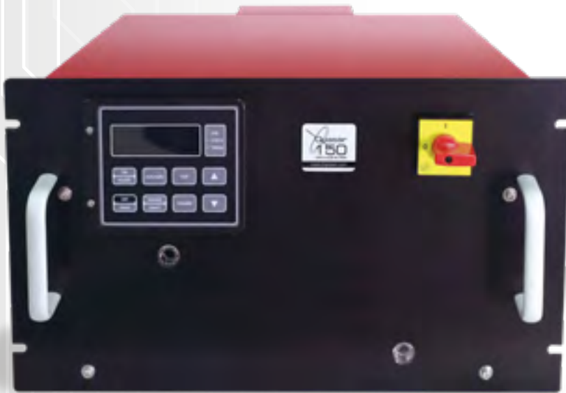
WATER COOLED VERSION