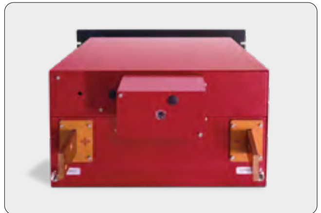
BACK VIEW - WATER COOLED VERSION