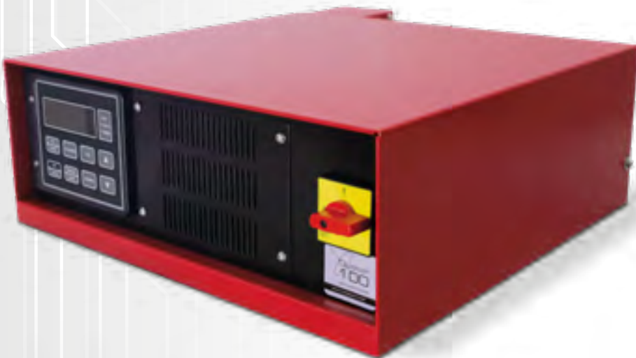
AIR COOLED VERSION