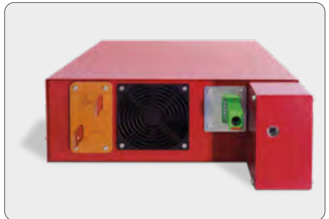
BACK VIEW - AIR COOLED VERSION